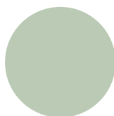
Linoleum: 4154 Pistachio